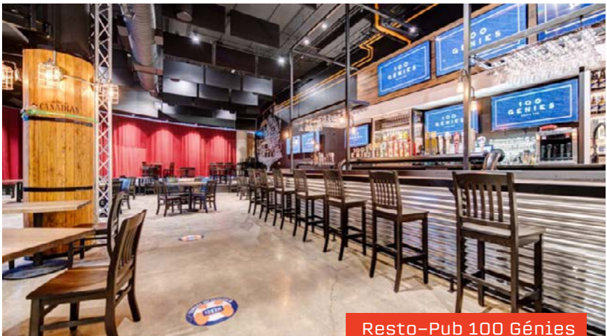
Resto-Pub 100 Génies

To get there, take the large staircase at the entrance of the building.